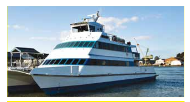
TG100 seal can be fitted to all vessels operating in abrasive waters including workboats, harbour tugs, offshore supply vessels, yachts, ferries, fishing trawlers, self-propelled dredgers, as well as navy, coast guard and police vessels.