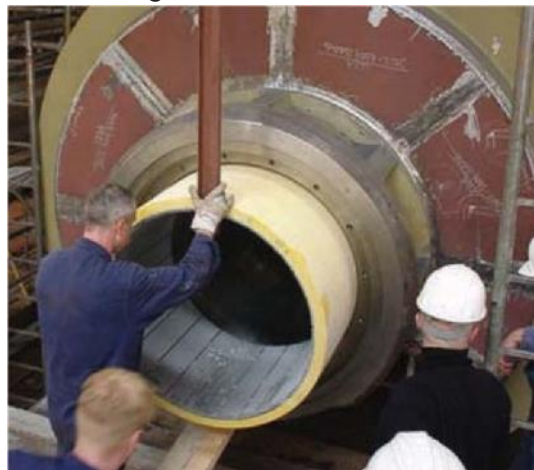
Composite cutterhead shaft bearing being installed on CSD J.F.J. de Nul