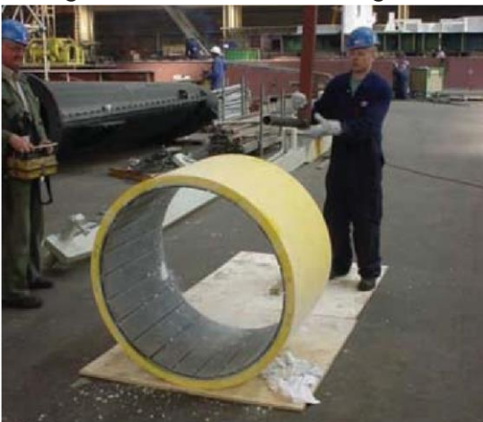
Composite cutterhead shaft bearing removed from dry ice and ready to be installed in housing

The required water flow for flushing and cooling the bearings is 0.15 L/min/mm (1 U.S.Gal./min./inch) of shaft diameter. Thordon Composite in combination with a hard shaft liner offers the best combination for long bearing wear life in abrasive environments. However, a good quality water flush also prevents the bearing from being clogged from the sand and rock particles from the cutterhead operation. Reducing the level of abrasive particles in the water flush to the bearings will translate into a longer wear life of the bearing.