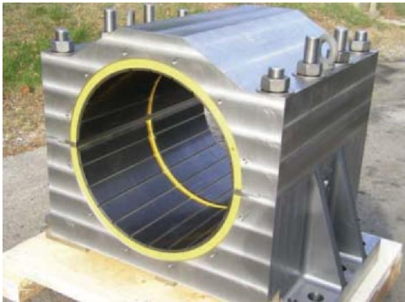
New Composite cutterhead intermediate lineshaft bearing